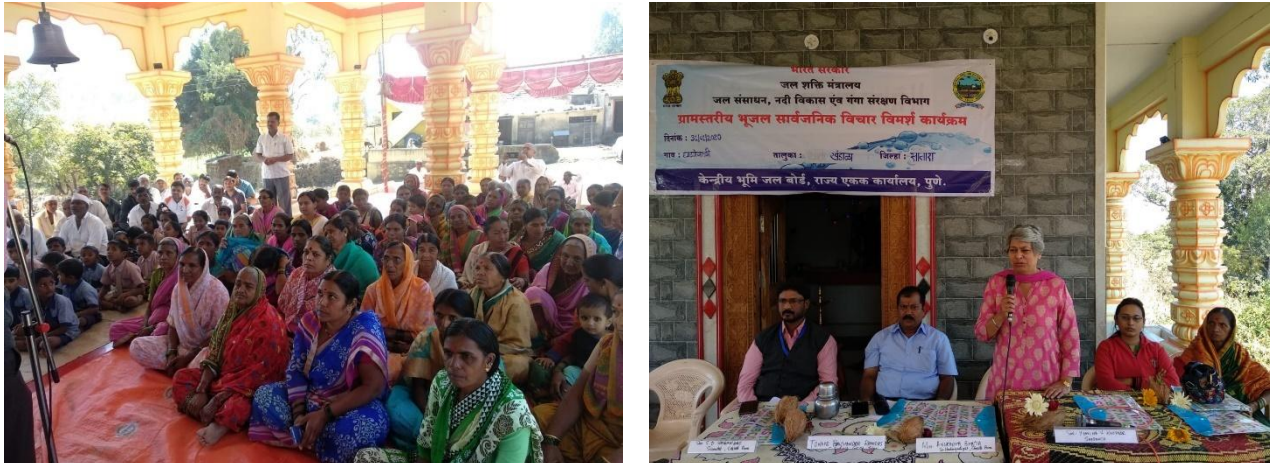
Photographs of the Public Interaction Programme organised at Gadgewadi, Taluka – Khandala, District – Satara on 31.1.2020