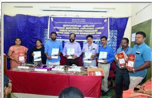
PIP at Karumkulam Grama Panchayath & Mangalapuram Panchayath, Thiruvananthapuram, Kerala