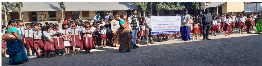
Rainwater Harvesting campaign at Zilla Parishad School, Deolali, Taluka – Shrirampur, District – Ahmednagar on 17.01.2020