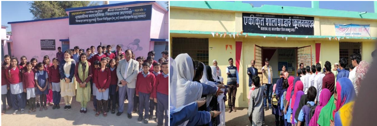
Water Conservation awareness program at Govt Middle School, Jarguwan village, BlockKurwai, Vidisha district on 24.01.2020 & Govt Higher Secondary School, Bakayanvillage, BlockKalapipal, Shajapur district on 28.01.2020- at Madhya Pradesh