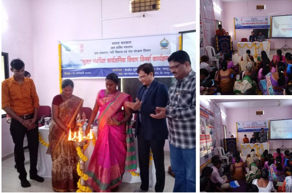
Photographs of the Public Interaction Programme organised at Champa, Taluka – Umrer, District – Nagpur on 23.01.2020